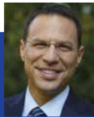
2018 CHILD PROMISE HUMANITARIAN AWARD Josh Shapiro , current Attorney General of Pennsylvania