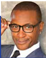
KEYNOTE SPEAKER Tommy Davidson , actor, comedian, and former adoptive child